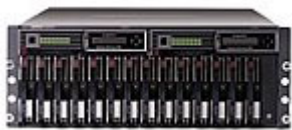
Figure 4. StorageWorks MSA1000

The HP StorageWorks Modular Smart Array 1000 (MSA1000) as shown in Figure 4, is a 2 Gb Fibre Channel storage system for the entry-level to midrange storage area network (SAN). It provides the customer with a low-cost, scalable, high performance storage consolidation system with investment protection. It is designed to reduce the complexity and risk of SAN deployments. The powerful but easy to use management software makes it ideal for departmental and remote location SANs. With the addition of two more drive enclosures, it can control up to 42 drives allowing capacity of six terabytes. All configuration, management and partitioning and licensing software come standard with no extra charges.