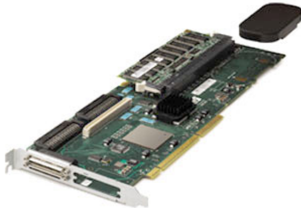
Figure 2. Smart Array 6402 controller