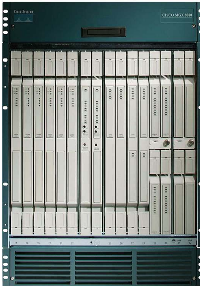
Figure 1. Cisco MGX 8880 Media Gateway

With its superior density, scalability, and performance, the Cisco MGX 8880 Media Gateway helps service providers to deploy a comprehensive set of voice over IP (VoIP) applications that help lower operational expenses and generate new services revenue. The Cisco MGX 8880 Media Gateway enables a range of packet voice applications for wireline, wireless and cable. With its comprehensive suite of quality of service (QoS) features and high availability hardware and software, the Cisco MGX 8880 Media Gateway allows service providers to optimize their existing network infrastructure and lay the foundation for the delivery of advanced services and (Figure 1).