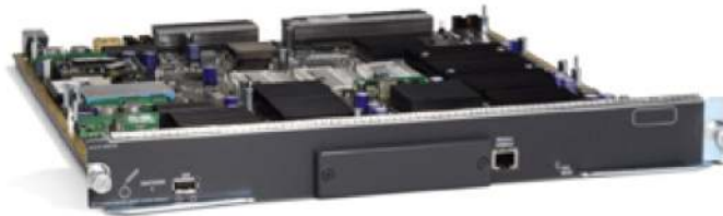
Figure 1. Cisco ACE Module

The Cisco ACE provides the following features, functions and benefits: