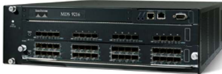
Figure 1. Cisco MDS 9216 Multilayer Fabric Switch

Note: Shown with optional 32-port Fibre Channel Switching Module