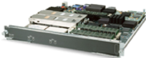
Figure 6. Cisco MDS 9000 Family Caching Services Module

Cisco has teamed with IBM to offer a network-based storage-management solution, which provides customers the ability to securely virtualize their storage from within the network. The Cisco MDS 9000 Family Caching Services Module (Figure 6) integrates two high-performance processing nodes that, when combined with IBM TotalStorage SAN Volume Controller Storage Software for the Cisco MDS 9000 Family, deliver network-hosted virtualization and replication services. Each Caching Services Module includes 8 GB of local cache. Multiple caching services modules can be clustered within the fabric to provide additional scalability and availability.