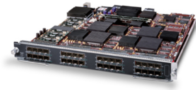
Figure 5. Cisco MDS 9000 Family Advanced Services Module

The Cisco MDS 9000 Family 32-port Fibre Channel Advanced Services Module (Figure 5) facilitates pooling of heterogeneous storage for increased storage usage, simplified storage management, and reduced TCO. The Cisco Advanced Services Module incorporates all the capability of the Cisco MDS 9000 Family Fibre Channel Switching Module and also provides scalable, in-band storage virtualization services. Using highly integrated VERITAS Storage Foundation for Networks software available from VERITAS and a highly distributed processing architecture, the Cisco Advanced Services Module delivers best-in-class virtualization performance, which can be scaled by simply adding modules anywhere in the fabric to meet the performance needs of even the largest enterprises.