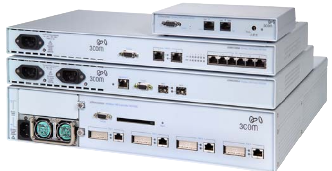
(from top: 3Com Wireless LAN Controller WX4400, Wireless LAN Controller WX2200, Wireless LAN Switch WX1200, WXR100 Remote Office Wireless LAN Switch)

The 3Com Wireless Switch Manager eliminates the time-consuming task of individually configuring each device. Simple and centralized setup makes initial deployment and long term management easier. Accessed from anywhere on the network, the Wireless Switch Manager software lets administrators change parameters of hundreds of managed access points or dozens of wireless switches with just a few keystrokes.