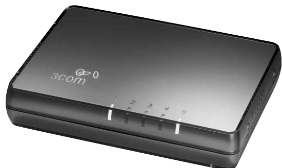
Shown above is the 3Com Switch 5 Port 3CFSU05

Operating system independence. Supports maximum integration of different operating systems within a network—no extra configuration of the network is required.