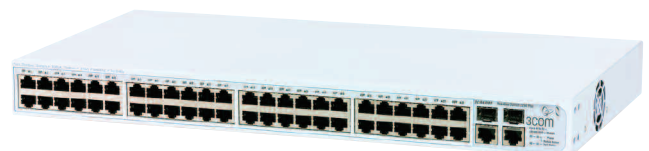
3Com Baseline Switch 2250 Plus

In addition, the web interface features individual port-traffic monitoring (port mirroring) and a unique, quick-glance switch status review. A cable diagnostic tool lets users troubleshoot basic connectivity problems via the web management interface further simplifying network installation.