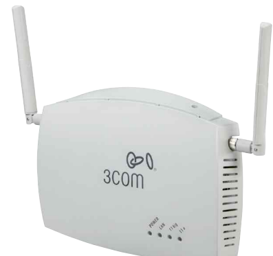
3Com AirProtect Sentry 5850 Wireless Intrusion Prevention System

The 3Com AirProtect Sentry 5850 Wireless Intrusion Prevention System can be set up in less than 15 minutes. A simple web interface guides you through the appropriate steps to quickly enable defense of your wireless network.